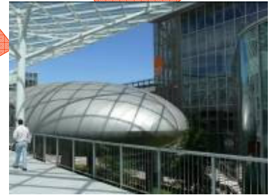
Industry Press Centre located in EPIA Village at LEM 4

You would like to organise a press conference? We offer you the opportunity to book a time slot and benefit from the press conference room located just next to the exhibition area. For tariffs and conditions see annex document.